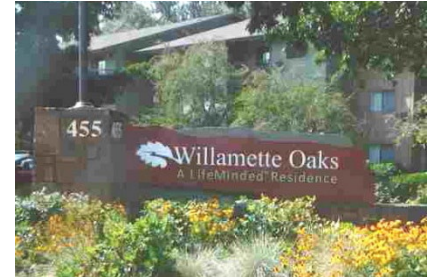
WELCOME SIGN – Willamette Oaks