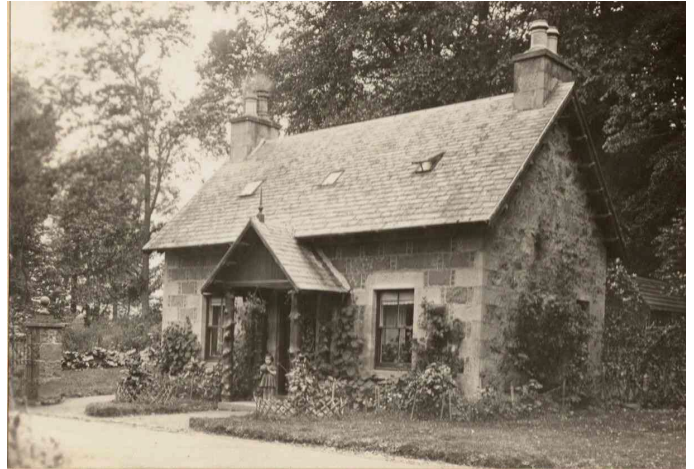
Her Parent's Cottage in Aberdeenshire, Scotland (1936)